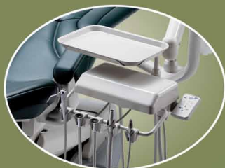
Optional AS-1 Hygiene Auto Control Head with Vacuum Package