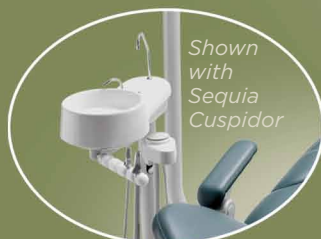
Optional Engle 360 Cuspidor Delivery System - Left/Right