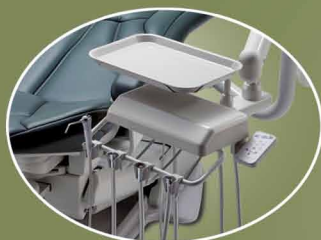
Optional AS-1 Auto Control Head