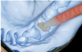
Luxatemp Ultra material being dispensed into a StatusBlue** matrix.