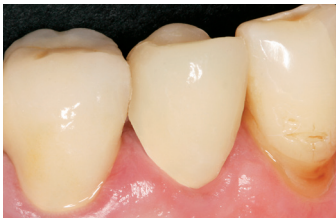
The end result; a highly esthetic, natural-looking temporary.