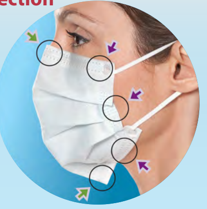
Aluminum nose and chin pieces (green arrows) reduce gapping (purple arrows).